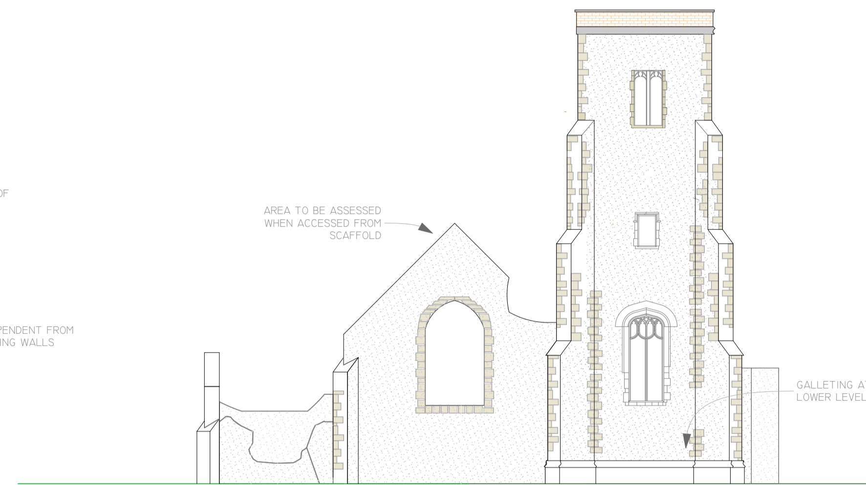
WEST EXTERNAL ELEVATION 1:100