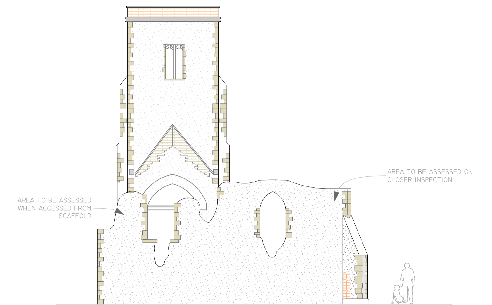
EAST EXTERNAL ELEVATION 1:100